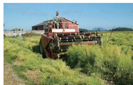
Collecting the seeds with their pods