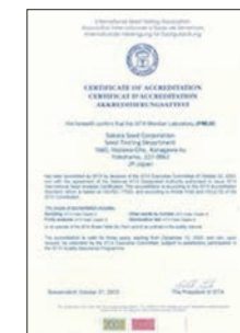
Certificate by the ISTA accredited Seed Testing Dept.