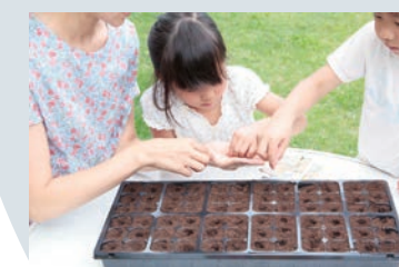
We also carry out activities to teach the next generation the joy and fun of planting seeds

It is Sakata Seed Corporation's responsibility to all of society to produce superior varieties and deliver happiness to society through those seeds. As a member of the agricultural and horticultural industry, we have contributed to the prosperity and sustainability of society and the environment through seeds. Going forward, we will continue to move forward with our stakeholders based on the spirit of our company motto "Quality" "Reliability" "Service" as a global R&D-based corporation that originated in Japan.