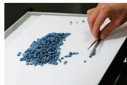
Physical purity test being conducted visually

Seeds produced around the world are collected at Sakata Seed Corporation for testing, treatment, and processing to ensure that seed quality meets or exceeds applicable criteria. Among other things, we check if there are any impurities mixed with the seeds, how many of them germinate, whether there has been any crossing with other varieties or mixing with different varieties and whether they have been contaminated by any pathogens. Our testing technology and quality management are highly acclaimed, and we were the first private seed company in Japan to have our germination test laboratory certified as an ISTA-accredited laboratory. Additionally, to make it easier for customers to use our products, seeds also undergo treatment to improve the uniformity of germination and pellet processing to make it easier to sow fine seeds. This is how seeds become a packaged product that is shipped to countries all around the world.