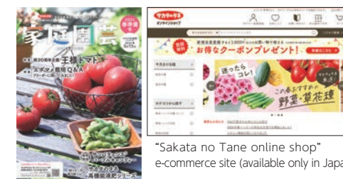
"Sakata no Tane online shop" e-commerce site (available only in Japan)

"Katei Engei," our mail order catalog (available only in Japan)