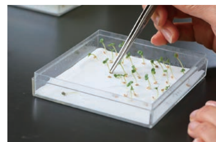
Germination test using the filter paper method