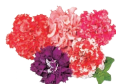
The world's first F 1 All Double Petunia, known as "Victorious Mixed"