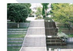
The headquarters public space certified as the SEGES urban oasis

Sakata Seed Corporation celebrated its 100th anniversary in 2013. Major challenges such as responding to climate change and protecting genetic resources have arisen in the agricultural and horticultural industry, which are closely linked to nature, and we now have an even greater responsibility for protecting the environment and society. Therefore, in 2022, we added "Mutual Harmony" to our management philosophies of "Mutual Prosperity" and "Mutual Interest." Based on this, we have renewed our promise to work toward continuous coexistence among nature on Earth, the society surrounded by nature, and companies as an integral part of the society.