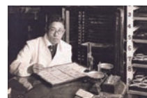
First private germination laboratory