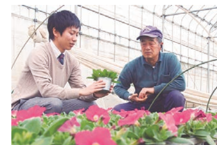
Proposing a new variety to a growers

Sakata Seed Corporation's seeds are only distributed to markets after passing through the rigorous standards of each process outlined. After shipping, the seeds pass through a variety of channels to reach customers. Some are sold wholesale at seeds and plants stores, Japanese agricultural cooperatives, gardening shops, and hardware stores, while others are sold through the mail order service we manage directly. We were also the first in the gardening industry to establish a Customer Relations Office where customers can consult us with questions and concerns about cultivation methods and other issues after buying our products. We also propose solutions such as agricultural and horticultural supplies along with the seeds and seedlings. We pursue products and services that delight the people that pick them up, such as by suggesting flower arrangement methods, vegetable recipes, and ways to use and enjoy seed varieties by making the most of their special characteristics.