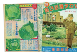
1940 seed catalog featuring "Suteki Kanran," the world's first F 1 cabbage