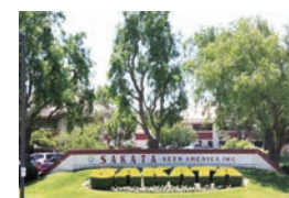
Sakata Seed America, Inc.

In the 1970s, we focused on breeding superior F 1 varieties while beginning a full-scale expansion overseas. We opened the Kimitsu Research Station in Chiba Prefecture in 1971 and not only increased the item we bred but also began to develop disease-resistant varieties and conduct adaptability tests for vegetable cultivation. Furthermore, in 1977 we released the "Andes" melon, a popular net melon that pleased many customers. Having changed Japan's standards for melons, Sakata had conquered a large part of the domestic melon seed market by the beginning of the 1990s and earned such a solid reputation that the saying went: "If it's melons you want, go to Sakata." Meanwhile, we established a local subsidiary in the United States in 1977 as an overseas business office. Our seeds were accepted by the American market in a short time, and both the sales volume and market share of our F 1 broccoli were high.