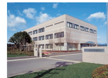
Kakegawa Research Center