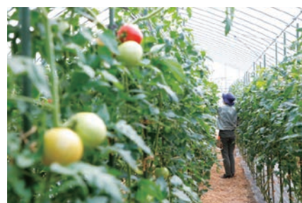
Breeding that utilizes the breeder's experience and expertise