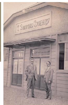
Headquarters around 1920 (then known as Sakata Shokai)