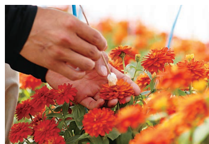
A process where each and every flower is cross pollinated by hand

We constantly breed outstanding variety as a research and development corporation. It is said that it takes 10 years of breeding to create one new variety. Despite that, Sakata Seed Corporation manages to release new varieties every year. We have been able to create many highly original varieties because of the wealth of genetic resources we have accumulated through our over 100-year history. Another strength is our network that stretches around the entire globe. We have research stations not only in Japan but around the world in places such as the USA, France, India and Brazil. Having locations in various regions allows us to breed varieties suitable for the lifestyles, culture, climate and natural features of that land.