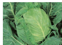
"Kinkei 201" cabbage

The main driving force behind the company's recovery from the devastation of World War II was the breeding of flowers, mainly petunias for export, at the Chigasaki Breeding Station. In 1957 Takeo's research bore fruit and "Glitters," a red and white petunia variety with single blooms and multiple flowers, won the Bronze award in the All-America Selections (AAS), establishing Sakata Seed Corporation as a flower breeding company with an unshakable position. The company's vegetable department was in the early stages of growing F 1 varieties in the 1960s. It produced cabbages such as the "Kinkei 201" and "Kinshun" varieties which are still well-known today. The "Prince" melon it released in 1962 also gained great popularity because it was both delicious and affordable. It was so popular, in fact, that fake "Prince" seeds even appeared on the market.