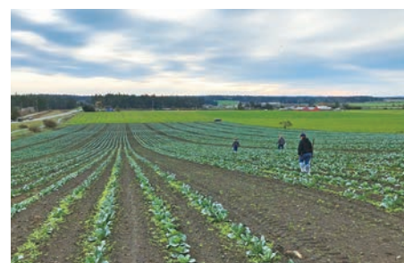
Cultivating seeds in dedicated seed collection fields

Seed varieties bred through R&D undergo cultivation experiments (trials) before commercialization. Through the cooperation of growers we have contracted around the world, we trial the new varieties in the farms (fields) and greenhouses where they will actually be cultivated. Through this process, we verify whether the seeds meet a variety of standards and decide whether they can be commercialized or not. The varieties we decide to commercialize are grown through the cooperation of contract seed producers and companies in various regions around the world. We do this because producing seeds in an environment close to their place of origin is the way to produce high-quality seeds. Moreover, we are able to reduce risks such as weather disasters and disease by dispersing the seed production areas, thus stabilizing the output supplied. Building this seed production system is what allows Sakata Seed Corporation to deliver a stable supply of high-quality seeds.