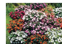
SunPatens bred using genetic resources based on the Convention on Biological Diversity